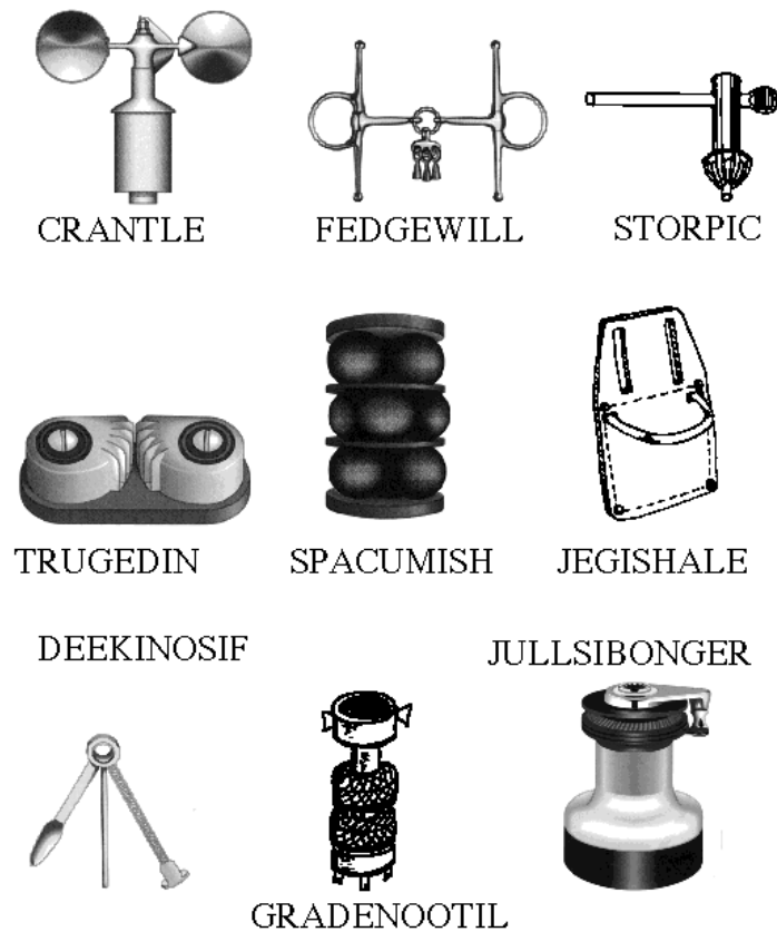
Figure 1: Nonword-picture pairs used in word learning task.

child population. For both of these reasons, presentation of the nonword-picture pairs was blocked by nonword length. Thus there were three nonword-picture pairs at each length (2-syllable, 3-syllable, 4-syllable), and all the pairs of a particular length were presented in one block. This procedure had the further advantage of preventing participants from using nonword length as a recall aid. Presentation order of pairs within each block was random without replacement.